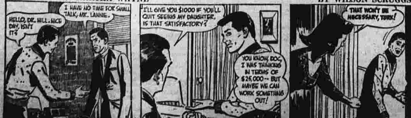
THE STORY OF MARTHA WAYNE