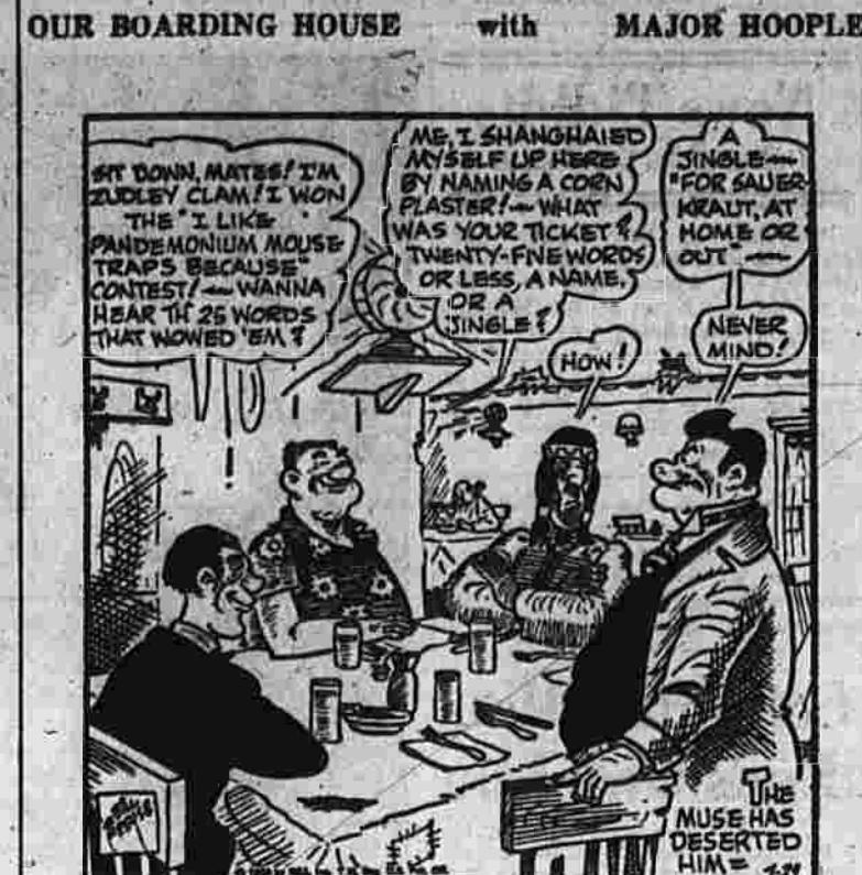
OUR BOARDING HOUSE