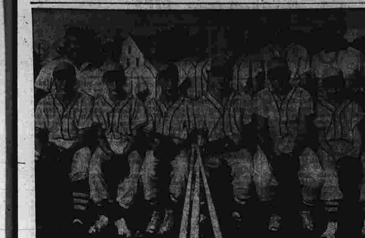
HARTFORD NATIONAL BANK CHAMPIONS